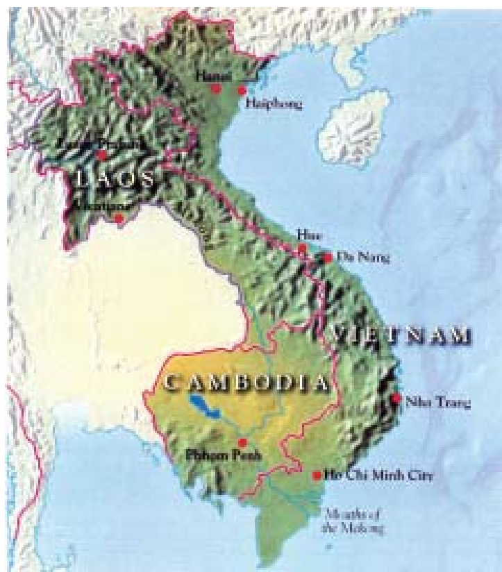
Fig. 1 – Map of Indo-China.

If you see the historical experience of Indo-China in relation to that of India, you will discover important differences in the way colonial empires functioned and the anti-imperial movement developed. By looking at such differences and similarities you can understand the variety of ways in which nationalism has developed and shaped the contemporary world.