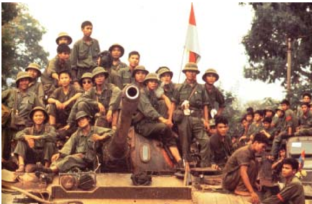
Fig. 21 – Vietcong soldiers pose triumphantly atop a tank after Saigon is liberated. What does this image tell us about the nature of Vietnamese nationalism?