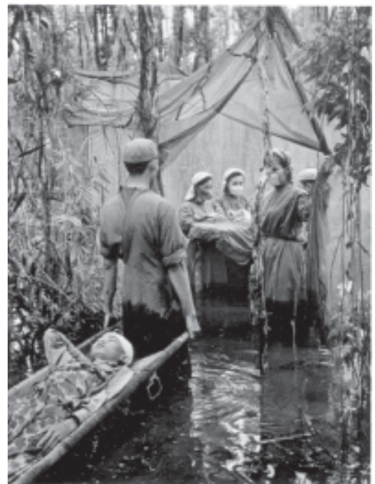
Fig. 19 – Vietnamese women doctors nursing the wounded.

Stories about women showed them eager to join the army. A common description was: 'A rosy-cheeked woman, here I am fighting side by side with you men. The prison is my school, the sword is my child, the gun is my husband.'