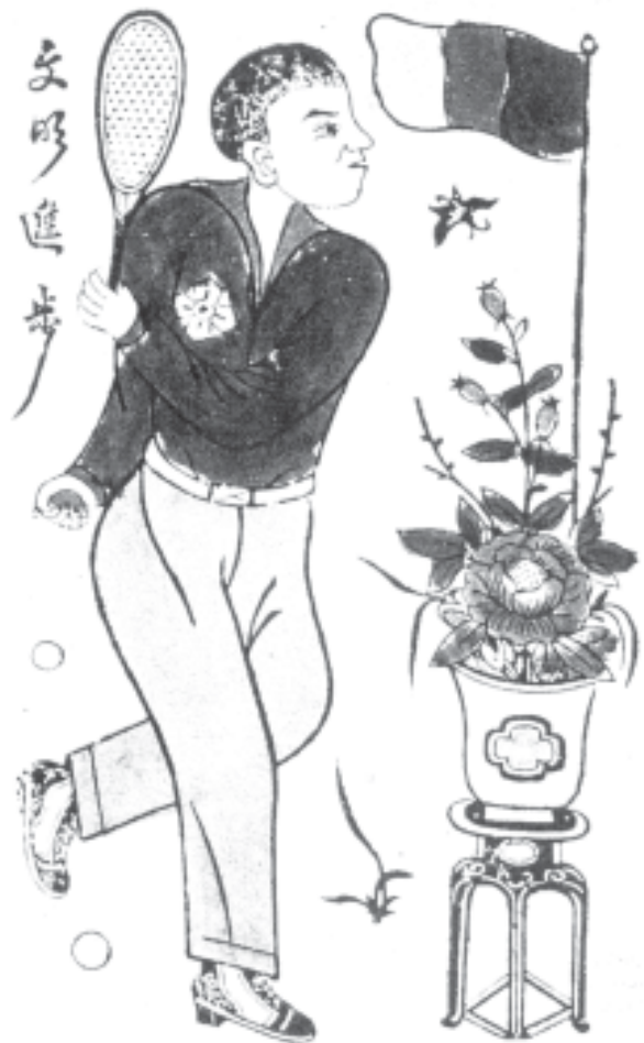
Fig. 6 – A local caricature ridiculing the Vietnamese who has been westernised. Abandoning his own culture, he has begun wearing Western clothes and playing tennis.