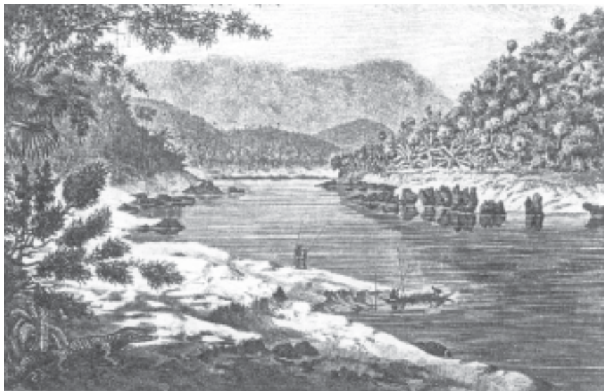
Fig. 4 – The Mekong river, engraving by the French Exploratory Force, in which Garnier participated. Exploring and mapping rivers was part of the colonial enterprise everywhere in the world. Colonisers wanted to know the route of the rivers, their origin, and the terrain they passed through. The rivers could then be properly used for trade and transport. During these explorations innumerable pictures and maps were produced.

French troops landed in Vietnam in 1858 and by the mid-1880s they had established a firm grip over the northern region. After the Franco-Chinese war the French assumed control of Tonkin and Anaam and, in 1887, French Indo-China was formed. In the following decades the French sought to consolidate their position, and people in Vietnam began reflecting on the nature of the loss that Vietnam was suffering. Nationalist resistance developed out of this reflection.