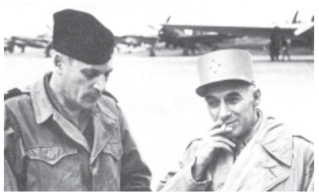
Fig. 10 – The French Commander in Indo-China, General Henri Navarre (right). Navarre wanted to attack the Vietminh even in their remote bases. As a consequence the French opened many fronts of attack and scattered their forces. Navarre's plans backfired in the North Eastern Valley of Dien Bien Phu.

With the help of the Ho Chi Minh government in the north, the NLF fought for the unification of the country. The US