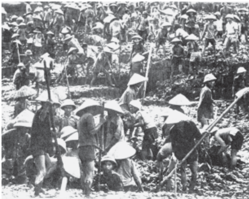
Fig. 15 – Rebuilding damaged roads. Roads damaged by bombs were quickly rebuilt.