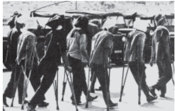
Fig. 20 – North Vietnamese prisoners in South Vietnam being released after the accord .

The widespread questioning of government policy strengthened moves to negotiate an end to the war. A peace settlement was signed in Paris in January 1974. This ended conflict with the US but fighting between the Saigon regime and the NLF continued. The NLF occupied the presidential palace in Saigon on 30 April 1975 and unified Vietnam.