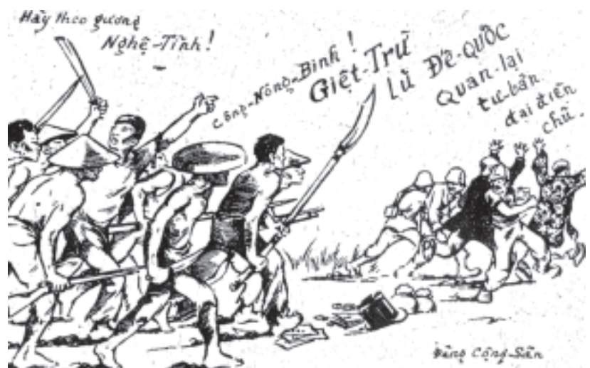
Fig. 9 – Cartoon of Vietnamese nationalists chasing away imperialists. In all such nationalist representations of struggle the nationalists appear heroic, marching ahead, while the imperial forces flee.

Soon, however, the anti-imperialist movement in Vietnam came under a new type of leadership.