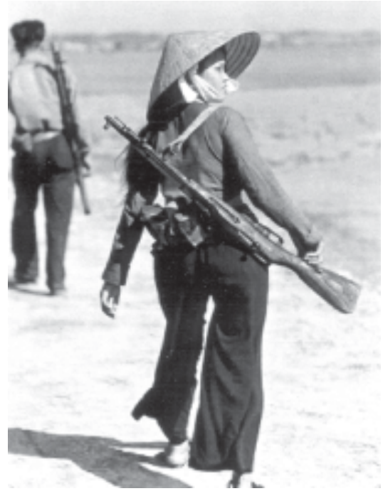
Fig. 18 – With a gun in one hand.

By the 1970s, as peace talks began to get under way and the end of the war seemed near, women were no longer represented as warriors. Now the image of women as workers begins to predominate. They are shown working in agricultural cooperatives, factories and production units, rather than as fighters.