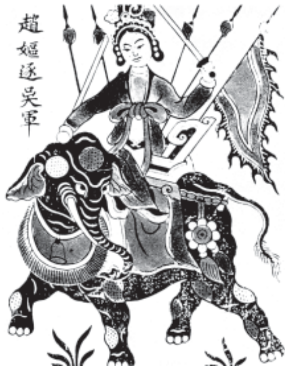
Fig. 17 – Image of Trieu Au worshipped as a sacred figure.

Other women rebels of the past were part of the popular nationalist lore. One of the most venerated was Trieu Au who lived in the third century CE. Orphaned in childhood, she lived with her brother. On growing up she left home, went into the jungles, organised a large army and resisted Chinese rule. Finally, when her army was