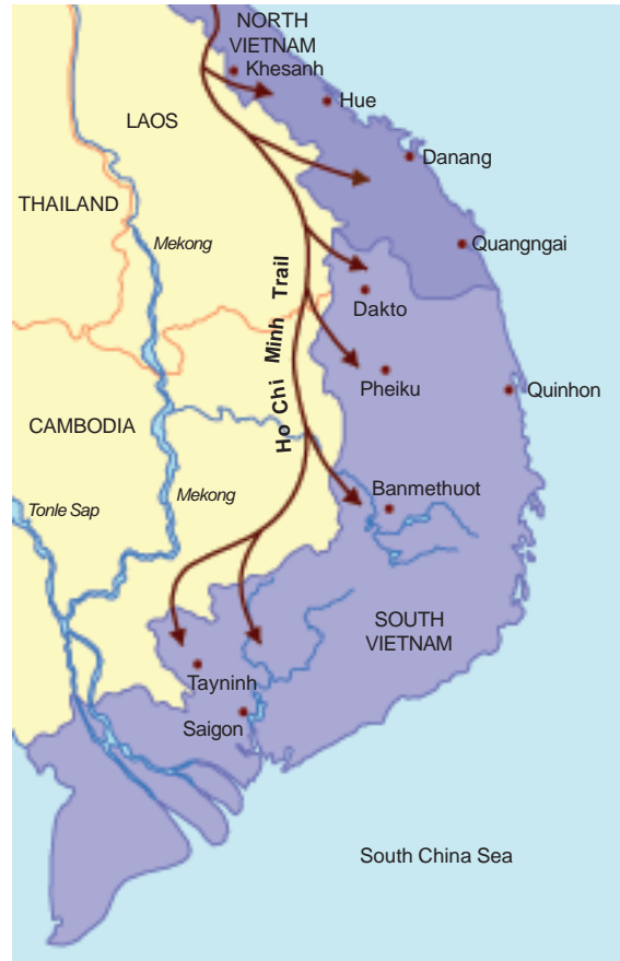
Fig. 14 – The Ho Chi Minh trail. Notice how the trail moved through Laos and Cambodia.

Most of the trail was outside Vietnam in neighbouring Laos and Cambodia with branch lines extending into South Vietnam. The US regularly bombed this trail trying to disrupt supplies, but efforts to destroy this important supply line by intensive bombing failed because they were rebuilt very quickly.