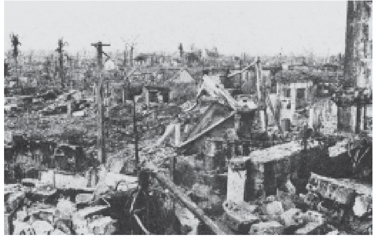
Fig. 13 – In December 1972 Hanoi was bombed.

The tonnage of bombs, including chemical arms, used during the US intervention (mostly against civilian targets) in Vietnam exceeds that used throughout the Second World War.