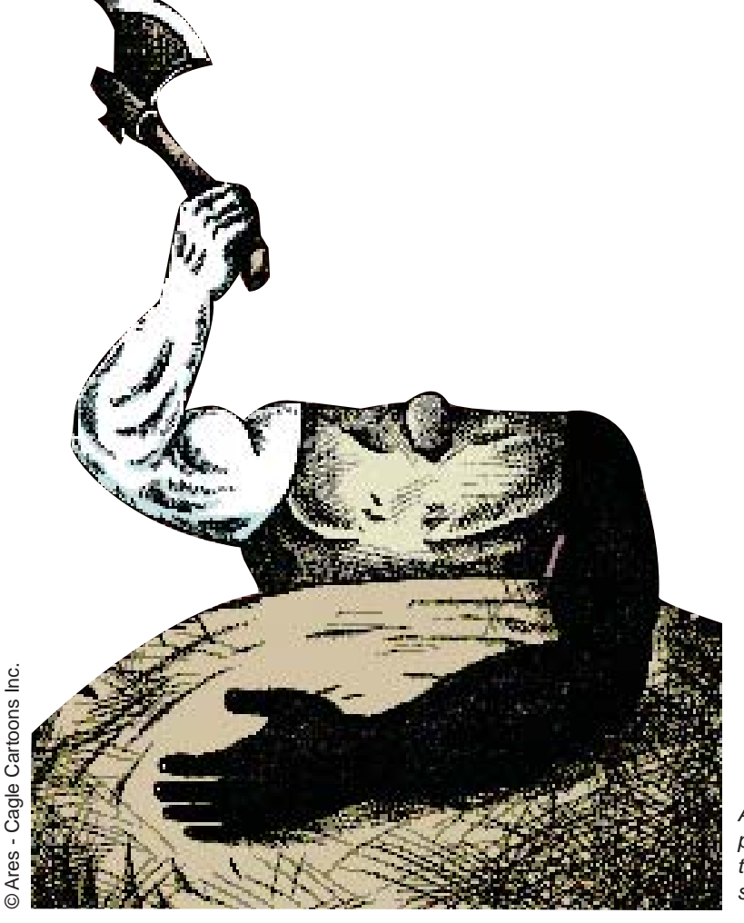
A cartoon like this can be read by different people to mean different things. What does this cartoon mean to you? How do other students in your class read this?

It is fairly common for people belonging to the same religion to feel that they do not belong to the same community, because their caste or sect is very different. It is also possible for people from different religions to have the same caste and feel close to each other. Rich and poor persons from the same family often do not keep close relations with each other for they feel they are very different. Thus, we all have more than one identity and can belong to more than one social group. We have different identities in different contexts.