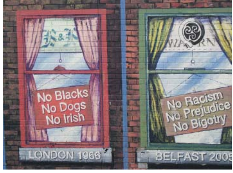
In some societies of Northern Ireland, the colonies of Protestant and Catholic communities are divided by walls. These walls are sometimes filled with graffiti as you can see here. The Irish Republican Army and British Government signed an agreement in 2005. What does the graffiti here tell about the conflict in the society?

Second, it depends on how political leaders raise the demands of any community. It is easier to accommodate demands that are within the constitutional framework and are not at the cost of another community.