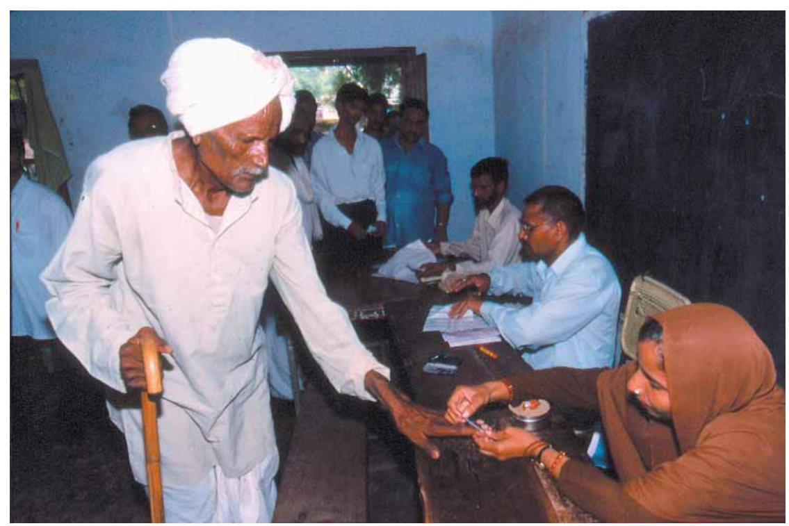
Voting in a rural area: A mark is put on the finger to make sure that a person casts only one vote.

decisions for the entire population. These days a government cannot call itself democratic unless it allows what is known as universal adult franchise. This means that all adults in the country are allowed to vote.