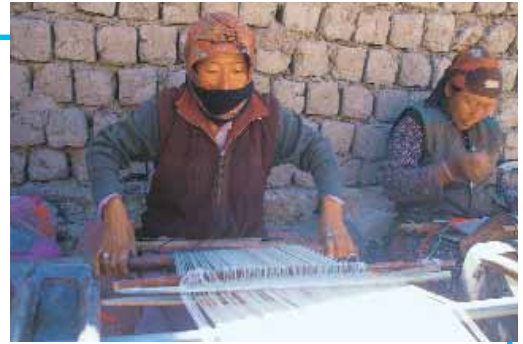
Woman weaving a pashmina shawl

Buddhism reached Tibet via Ladakh. Ladakh is also called Little Tibet. Islam was introduced in this region more than four hundred years ago and there is a significant Muslim population here. Ladakh has a very rich oral tradition of songs and poems. Local versions of the Tibetan national epic the Kesar Saga are performed and sung by both Muslims and Buddhists.