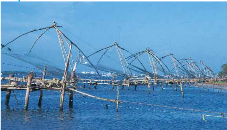
Chinese Fishing Nets

Even the utensil used for frying is called the cheenachatti , and it is believed that the word cheen could have come from China. The fertile land and climate are suited to growing rice and a majority of people here eat rice, fish and vegetables.