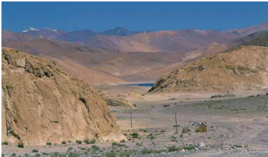
The dry barren landscape of the mountainous desert of Ladakh.

Ladakh is a desert in the mountains in the eastern part of Jammu and Kashmir. Very little agriculture is possible here since this region does not receive any rain and is covered in snow for a large part of the year. There are very few trees that can grow in the region. For drinking water, people depend on the melting snow during the summer months.