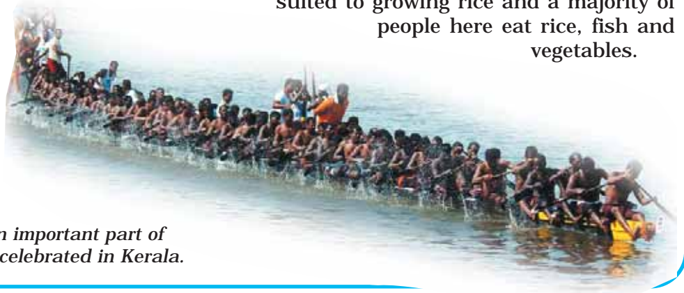
The boat race is an important part of the Onam festival celebrated in Kerala.

an attractive place for traders. Jewish and Arab traders were the first to come here. The Apostle of Christ, St. Thomas is believed to have come here nearly