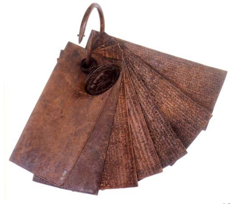
Fig. 2 This is a set of copper plates recording a grant of land made by a ruler in the ninth century, written partly in Sanskrit and partly in Tamil. The ring holding the plates together is secured with the royal seal, to indicate that this is an authentic document.

Kings often rewarded Brahmanas by grants of land. These were recorded on copper plates, which were given to those who received the land.