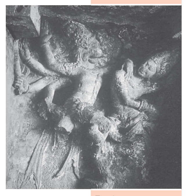
Fig. 1 Wall relief from Cave 15, Ellora, showing Vishnu as Narasimha, the man-lion. It is a work of the Rashtrakuta period.

Many of these new kings adopted high-sounding titles such as maharaja-adhiraja (great king, overlord of kings), tribhuvana-chakravartin (lord of the three worlds) and so on. However, in spite of such claims,