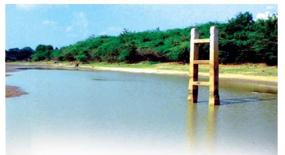
flooding and canals had to be constructed to carry water to the fields. In many areas two crops were grown in a year.