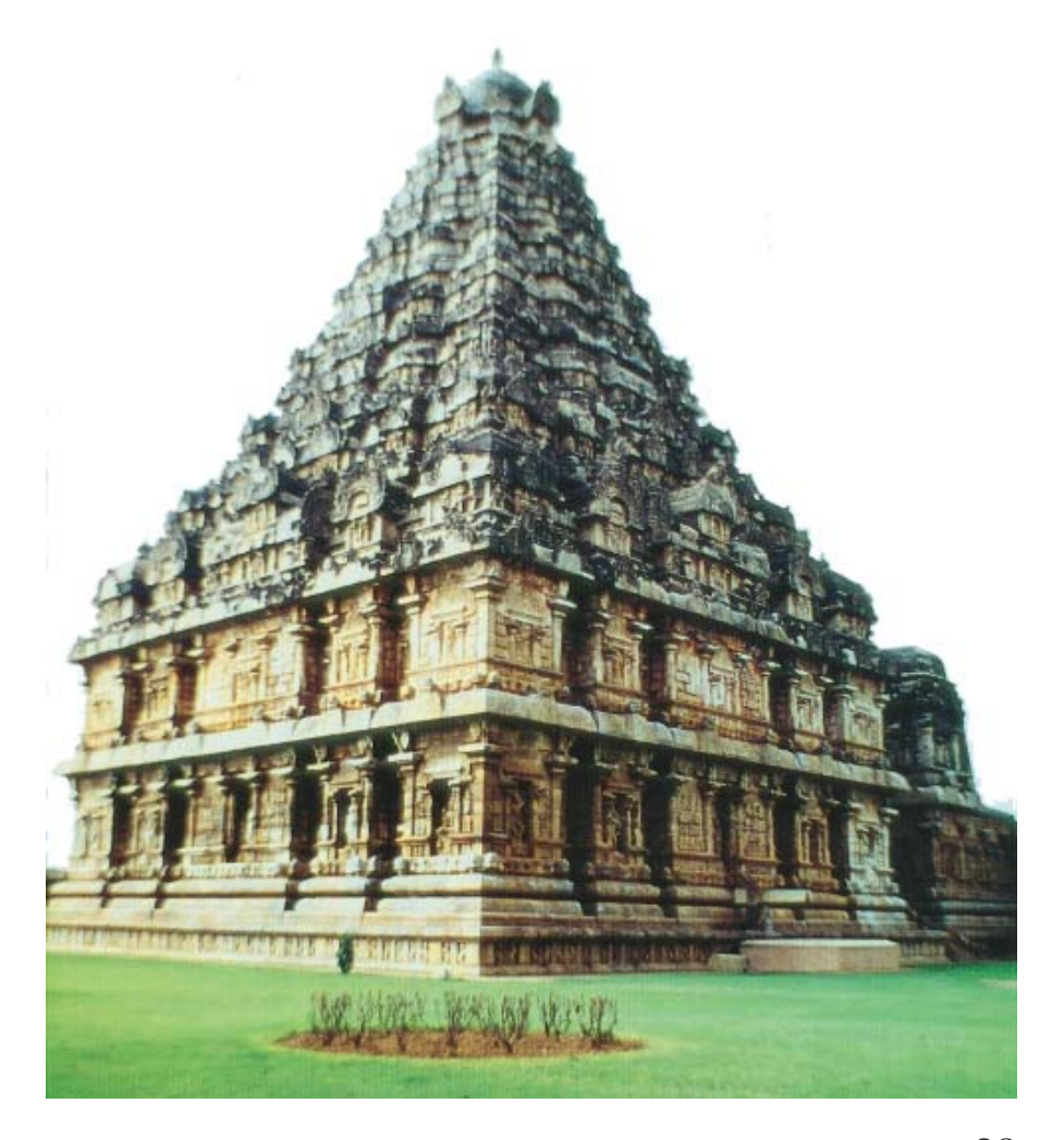
Fig. 3 The temple at Gangaikondacholapuram. Notice the way in which the roof tapers. Also look at the elaborate stone sculptures used to decorate the outer walls.

Chola temples often became the nuclei of settlements which grew around them. These were centres of craft production. Temples were also endowed with land by rulers as well as by others. The produce of this land