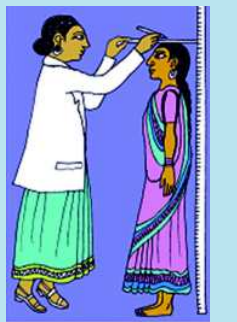
Fig 17.2: Measuring the height

Let each student in the class find out the weight and height of three adult persons of different economic backgrounds like office workers, servants, business person etc. Collect the data from all the students and