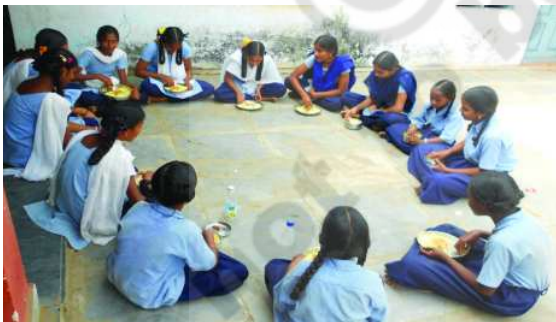
Fig 17.3: Children taking mid day meal in school

The new policy on PDS has been at the center of much debate. We know that about 4 out of 5 people in the rural areas consume less than the minimum required calories. And yet, not even 3 out of 10 families in the rural areas in India possessed BPL and Antyodaya cards, as per the National Sample Survey of 2004. Thus, a large number of people who earlier benefited from the PDS were no longer covered by it. Many families of landless labourers did