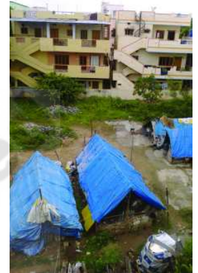
Fig 17.1: Discuss the different living standards in the above urban picture