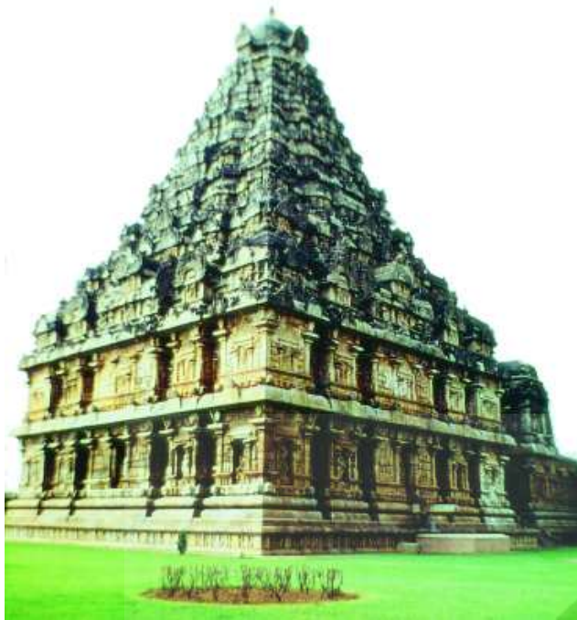
Fig 13.3 The temple at Gangaikonda-Cholapuram. Notice the way in which the roof tapers. Also look at the elaborate stone sculptures used to decorate the outer walls.

became king in 985 AD and expanded control over most of these areas. He also reorganised the administration of the empire. Rajaraja's son Rajendra I continued his policies and even raided the Ganga valley, Sri Lanka and countries of Southeast Asia, developing a navy for these expeditions.