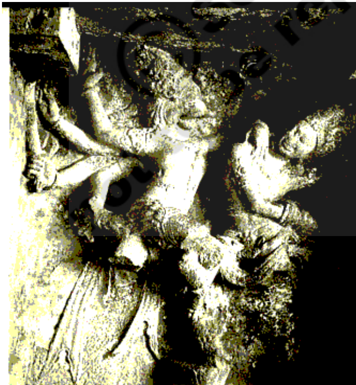
Fig 13.1 Wall relief from Cave 15, Ellora, showing Vishnu as Narasimha, the man-lion. It is a work of the Rashtrakuta period.

In other cases, men from enterprising families used their military skills to carve out kingdoms. For instance, the Kadamba Mayurasharman and the Gurjara-Pratihara Harichandra were Brahmanas who gave up their traditional professions and took to arms, successfully establishing kingdoms in Karnataka and Rajasthan respectively.