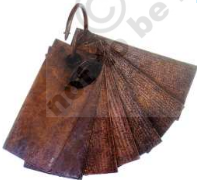
Fig 13.2 This is a set of copper plates recording a grant of land made by a ruler in the ninth century, written partly in Sanskrit and partly in Tamil. The ring holding the plates together is secured with the royal seal, to indicate that this is an authentic document.

Kings often rewarded Brahmanas by grants of land. These were recorded on copper plates, which were given to those who received the land.