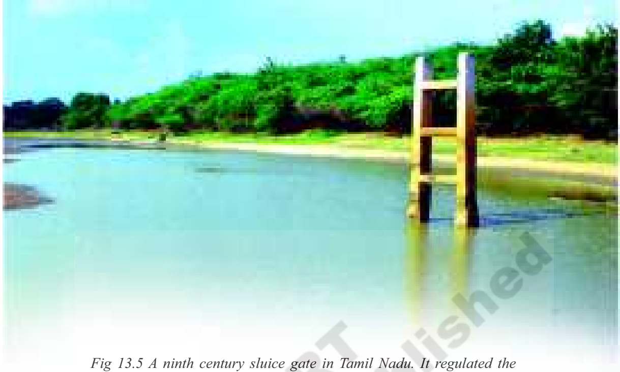
Fig 13.5 A ninth century sluice gate in Tamil Nadu. It regulated the outflow of water from a tank into the channels that irrigated the fields.

Although agriculture had developed earlier in other parts of Tamil Nadu, it was only from the fifth or sixth century that this area was opened up for large-scale cultivation. Forests had to be cleared in some regions; land had to be levelled in other areas. In the delta region embankments had to be built to prevent flooding and canals had to be constructed to carry water to the fields. In many areas two crops were grown in a year.