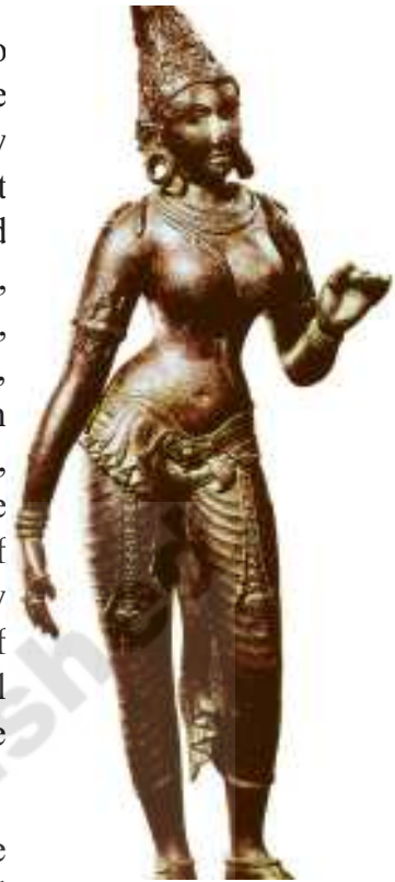
Fig 13.4 A Chola bronze sculpture. Notice how carefully it is decorated.

Many of the achievements of the Cholas were made possible through new developments in agriculture. Look at Map 2 again. Notice that the river Kaveri branches off into several small streams before emptying into the Bay of Bengal. These streams overflow frequently, depositing fertile soil on their banks. Water from the streams also provides the necessary moisture for agriculture, particularly the cultivation of rice.